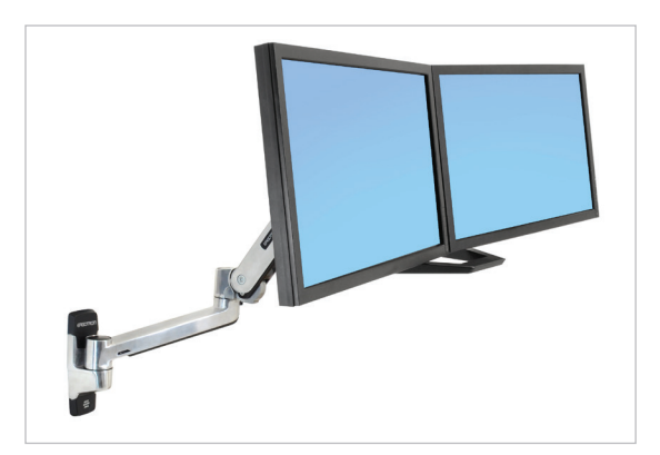
Dual Monitor & Handle Kit (#97-783) is the perfect dual-mounting solution for monitors 17" to 24"; the handle makes it easy to reposition screens