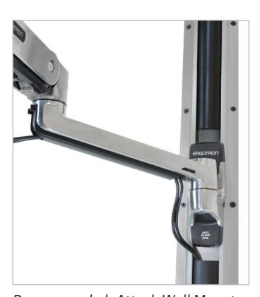
Recommended: Attach Wall Mount Arm to an Ergotron Wall Track using bracket (#97-091)